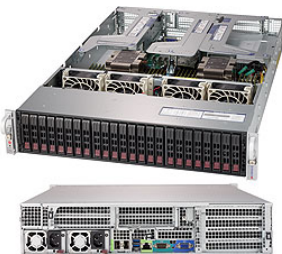
Supermicro SuperServer SYS-2029U-E1CRT

Tested by NVIDIA on knowledge worker workloads (Excel, Word, PowerPoint, Chrome, Media Player, PDF) running on a single HD-resolution display with NVIDIA GRID 7.1 and NVIDIA T4-1B