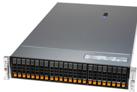
Figure 6 - Hyper Server

Hyper Family - The Hyper servers are designed for maximum rackmount flexibility with rear and front I/O for today's data center requirements as a single or dual socket server. These systems can handle the maximum wattage of CPUs and the maximum number of DIMMs to accelerate a wide range of workloads. In addition, the Hyper systems sport many PCI-E slots (up to eight) for extreme flexibility, are toolless for fast and easy servicing, and come with various storage devices (NVMe/SAS/SATA). The Hyper systems can also support up to 2 AIOM/OCP 3.0 NICs.