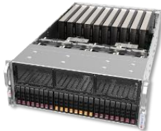
H13 4U PCIe GPU System Maximum Acceleration for AI/ Deep Learning and HPC