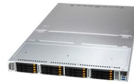
Petascale Storage System Scalable, High Performance NVMe and Hybrid Storage Architectures