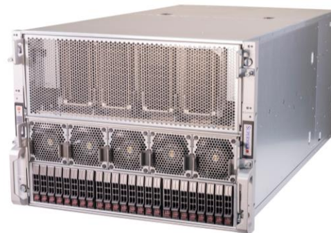
Figure 4 - 8U 8 GPU Server