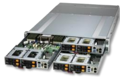
H13 GrandTwin™ Leading Multi-Node Architecture with Front or Rear I/O