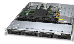
H13 CloudDC All-in-One Servers with Flexible I/O Options for Cloud Scale Data Centers