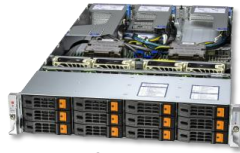
H13 Hyper Industry Leading IOPS Server with Energy Efficiency and Flexibility