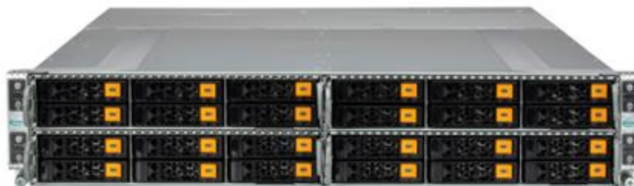
Figure 2 - Supermicro GrandTwin(TM)

Diskless HPC • All-Flash HCI • Hybrid Cloud • All-Flash NVMe Storage • High-Performance File Systems • Software-Defined Storage