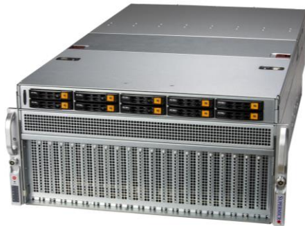
Figure 3 - 5U GPU Server with OAM GPUs

For the Supermicro GPU systems, all of the new features of the 4 th Gen AMD EPYC processors will help high-end applications perform better and return faster with the latest GPU systems from Supermicro. More and faster cores, higher bandwidth to the GPUs and other devices, and the ability to address vast amounts of memory are exactly what large HPC and AI applications demand.