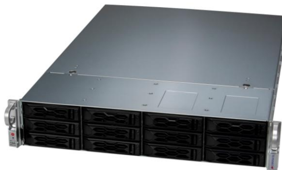
Figure 7 - CloudDC Server

The 4 th Gen AMD EPYC processor features that would benefit these applications include the increased core count and PCI-E 5.0.