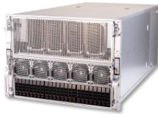
H13 8U Universal GPU System Next Generation Machine Learning Platform with 8x NVIDIA H100 GPUs