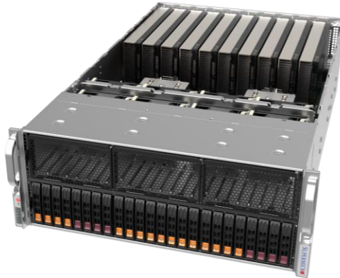
Figure 5 - GPU System w/PCI-E GPUs

GPU Systems with PCI-E will benefit significantly from the PCI-E 5.0 communications bus, the increased number of cores, and up to 6TB of memory that this system can accommodate.